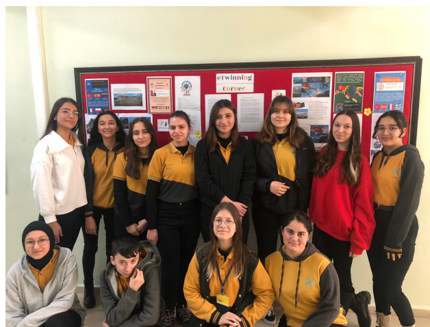
Amasya Social Studies Gymnasium, Amasya

Thanks to our Turkish school partners, Ali Akkanat Anatolian Gymnasium in Istanbul und Amasya Social Studies Gymnasium in Amasya , we can safely send the aid packages to the people who need them most.