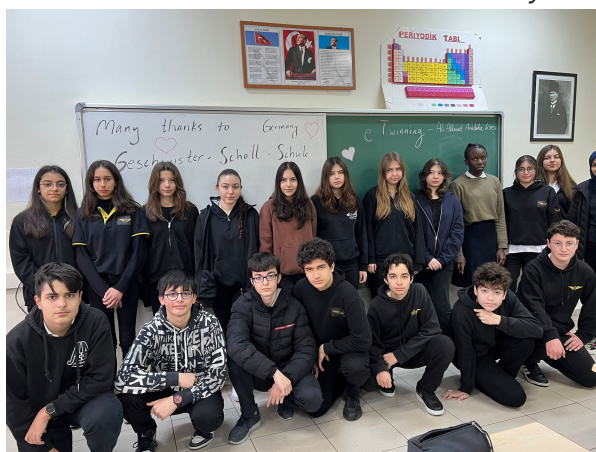
Ali Akkanat Anatolian Gymnasium Istanbul